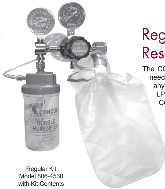
Regular Kit Model 806-4530 with Kit Contents