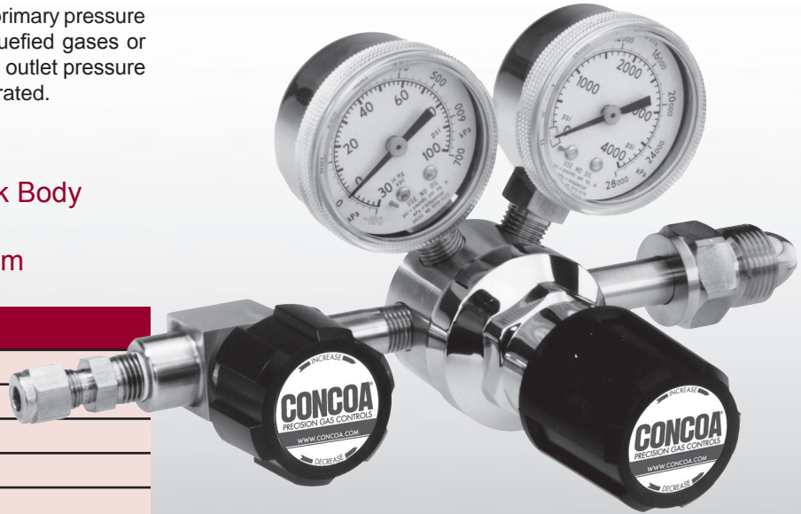
302 2331-580 shown