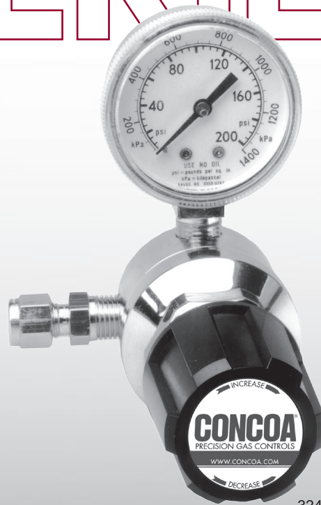
324 3021-000 shown