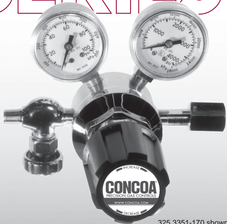
325 3351-170 shown