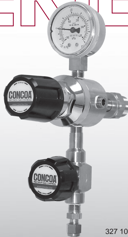
327 1032-M1L shown