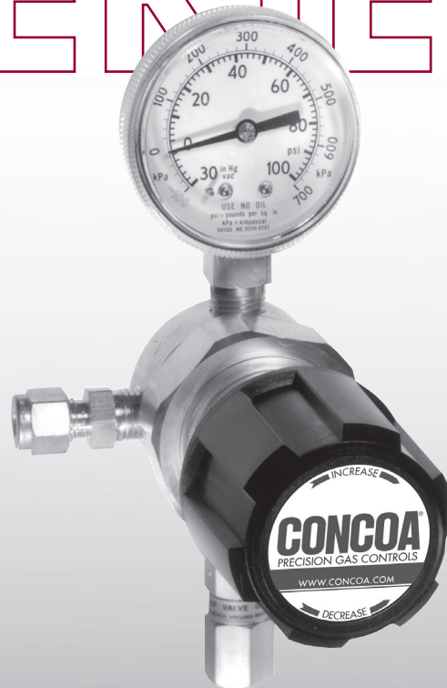
403 2021-000 shown