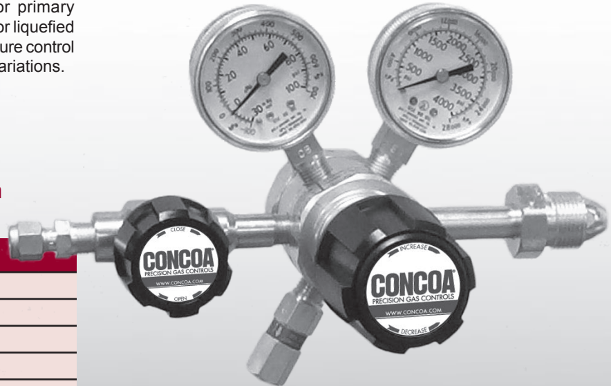
412 2331-580 shown