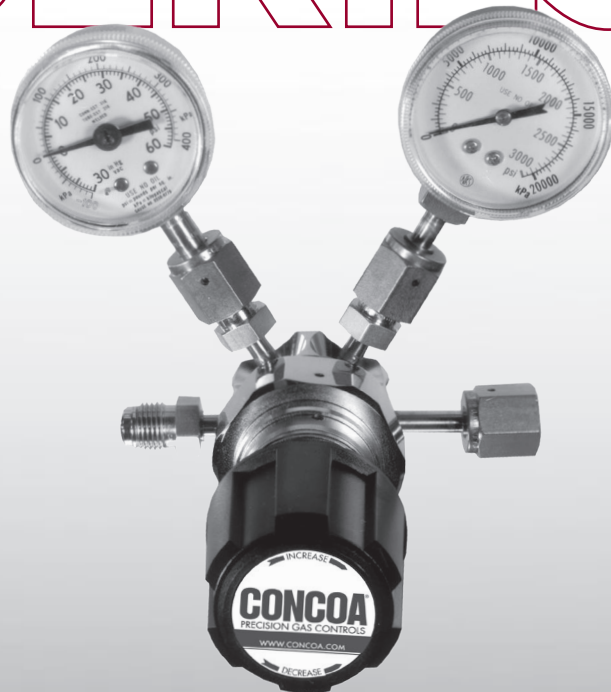
429 2241-001 shown