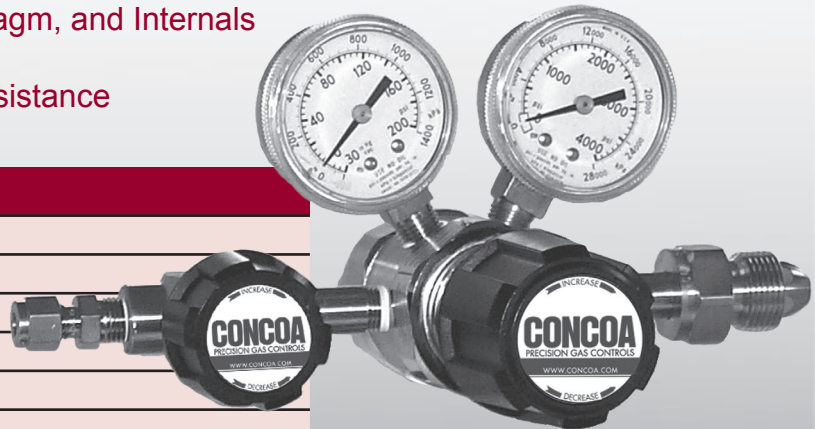
430 3331-330 shown