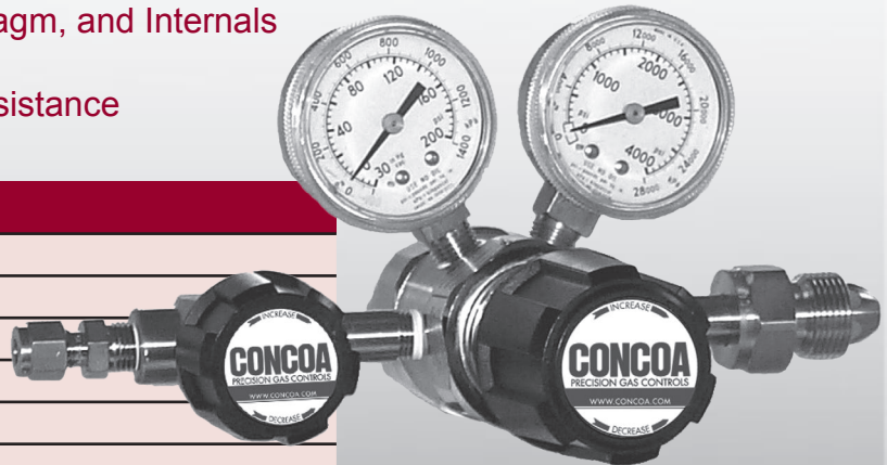
430 3331-330 shown