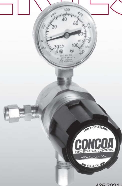
435 2021-000 shown