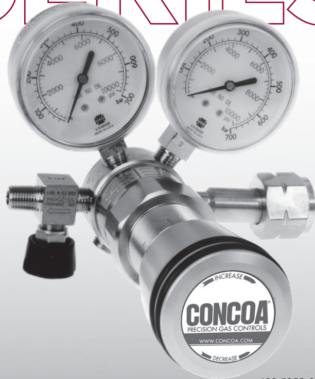
493 5952-677 shown