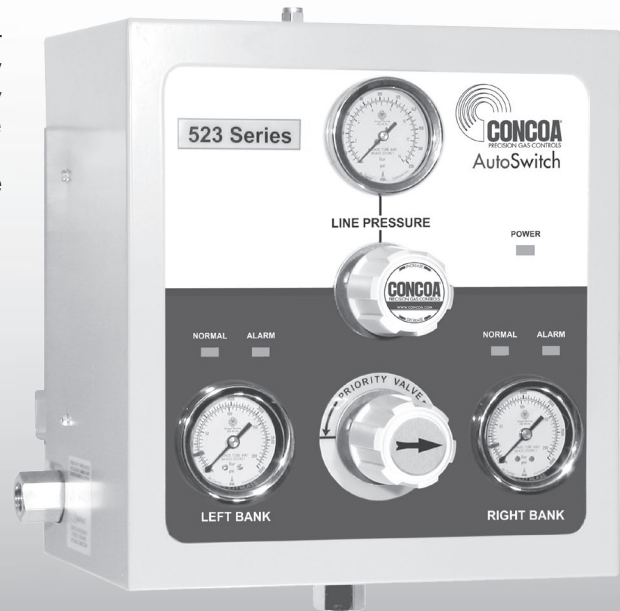
523 3004 shown