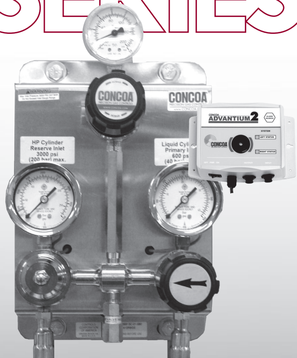
526 C14B shown with attached flexible hoses.