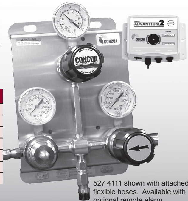
527 4111 shown with attached flexible hoses. Available with optional remote alarm.