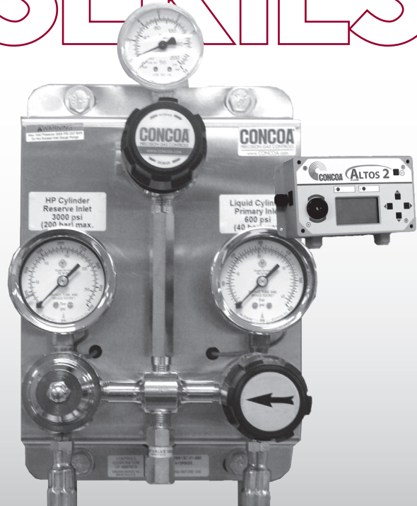
526 C14B shown with attached flexible hoses.