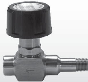
533 3043 Shown

The unique design of the 533 Series allows low torque operation with gas flow in either direction. Directional arrows are provided to indicate suggested flow direction.