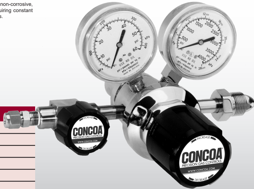
212 2331-580 shown