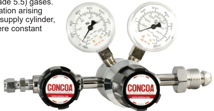
312 3331-01-580 shown