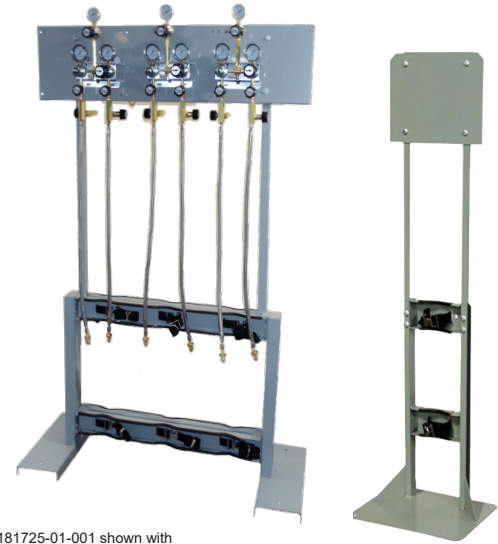
5181725-01-001 shown with 526 switchovers (sold separately)