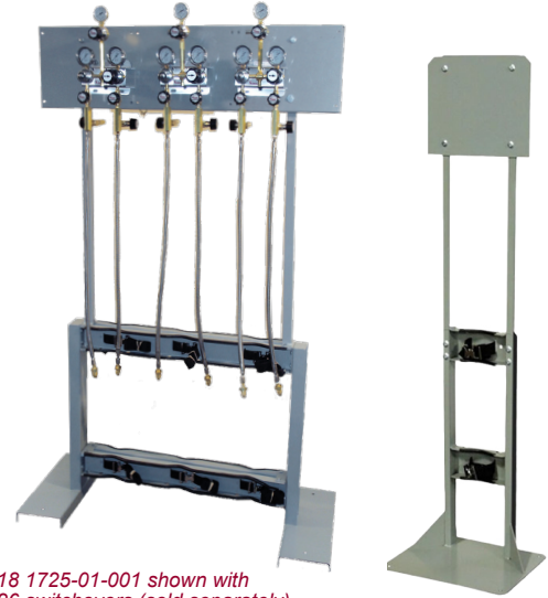
518 1725-01-001 shown with 526 switchovers (sold separately)